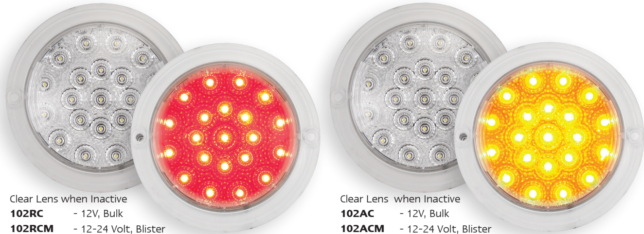
Clear Lens when Inactive 102RC - 12V, Bulk 102RCM - 12-24 Volt, Blister