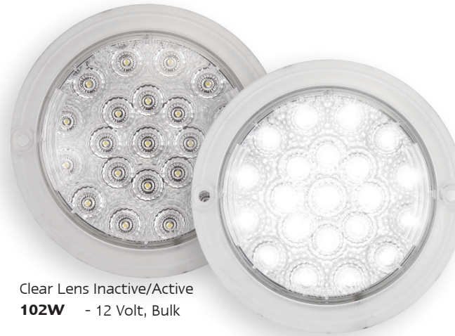
Clear Lens Inactive/Active 102W - 12 Volt, Bulk