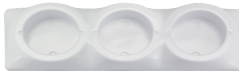
Triple White Bracket 102W3B - Bulk